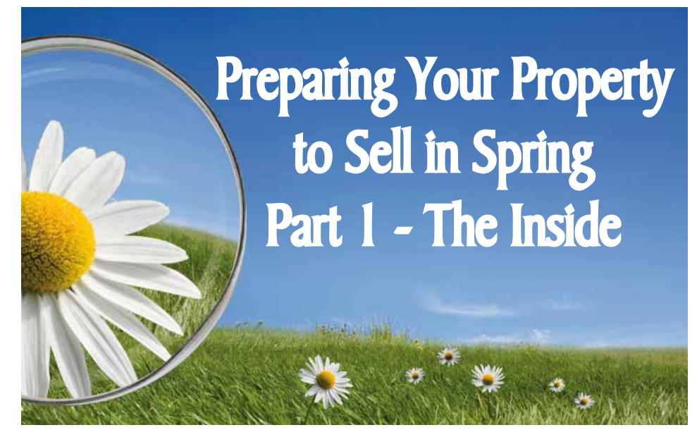
With Spring now here, it is the perfect time to think not only about selling your property, but how best to prepare and display your property to the greatest effect.

By taking a few simple steps you can ensure the inside of your property stands out from the crowd.